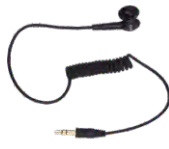
ES-01 Receive-Only Earbud