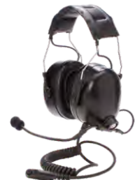
ECN21-P UL913 Noise-Cancelling Headset with PTT and boom microphone