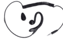
EH-01 Receive-Only C-Style Earloop