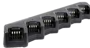
MCL32 6-Radio Multi-Unit Charger