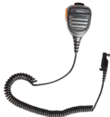
SM26N2-P UL913 Palm PTT Mic with Speaker and emergency button (IP54)