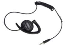
EH-02 Receive-Only Swivel Earpiece