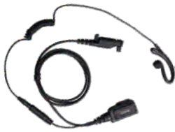
EHN26-P UL913 C-style Earpiece with microphone and in-line PTT button

External earpieces and microphones that attach directly to the radio