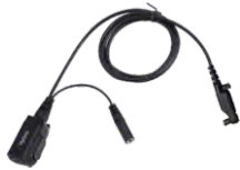
ACN-02-P UL913 Mic and PTT button with VOX and 3.5mm Jack Receive-only Earpiece (IP54)

External earpieces that are used in combination with the ACN-02-P