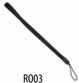
R003 Nylon Hand Strap

INCLUDED WITH THE HP702 UL913 and HP782 UL913