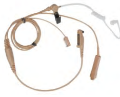
EAN21-P UL913 3-wire Surveillance Earpiece with Transparent Acoustic Tube