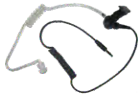
ES-02 Receive-Only Transparent Acoustic Tube