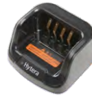
CH10L27 Drop-In Single Unit Charger