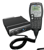
Local hand-held control head