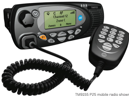
TM9155 P25 mobile radio shown with optional keypad microphone.