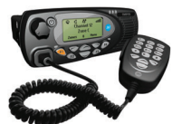
Local standard control head